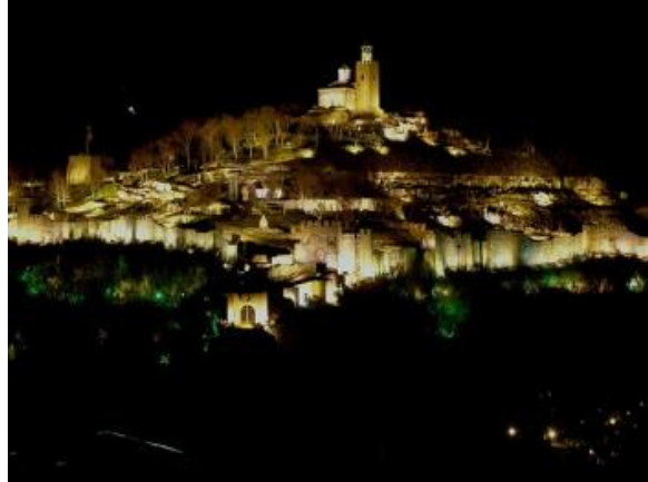
Sound& Light at Tsarevets Hill

Morning visit of the Iskra Museum of History in Kazanluk where some of the unique Thracian golden treasures discovered in the region are on display and the famous 4 th c. BC Kazanluk Thracian Tomb , listed by UNESCO as World Cultural Heritage. After lunch departure to Veliko Turnovo – the medieval Bulgarian capital. Cross the Balkans via the Shipka Pass. En route see the Russian Memorial Cathedral of Shipka and Etura , architectural-ethnographic museum. Upon arrival sightseeing tour of Veliko Turnovo including Tsarevets Hill and Samovodene market. Dinner and overnight in Veliko Turnovo (B,L,D)