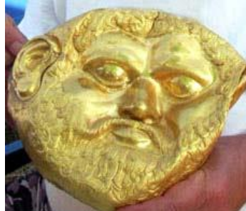
Golden mask (4 th c. BC)